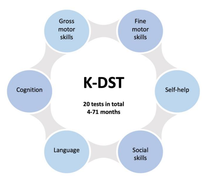
Fig. 1. Six domains of the Korean Developmental Screening Test for Infants and Children (K-DST).

Program for Infants and Children (NHSPIC) (Fig. 1). Since then, test restandardization and revalidation were conducted in 2017 using 3.06 million infants and children who were checked as part of the NHSPIC in 2015–2016. The revised K-DST was subsequently published.